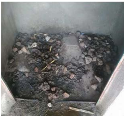
Figure 6. VIP Latrine for girls in Bole High school during of data collection in Boset District, Oromia, Ethiopia. 2016.