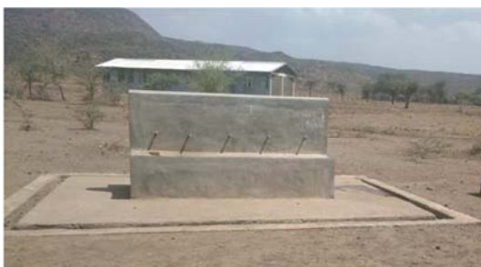
Figure 7. Water supply scheme in Doni High school; the school did not get water due to frequent water cut during data collection; Boset district, Oromia region, Ethiopia. 2016.