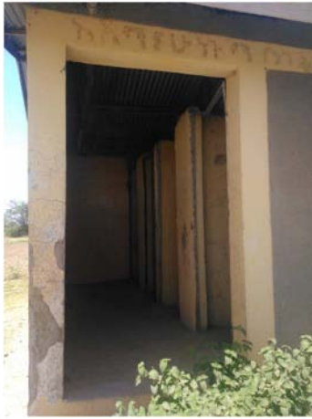
Figure 5. Broken latrine under use by girls in Doni Secondary school in Boset district, Oromia region, Ethiopia. 2016.