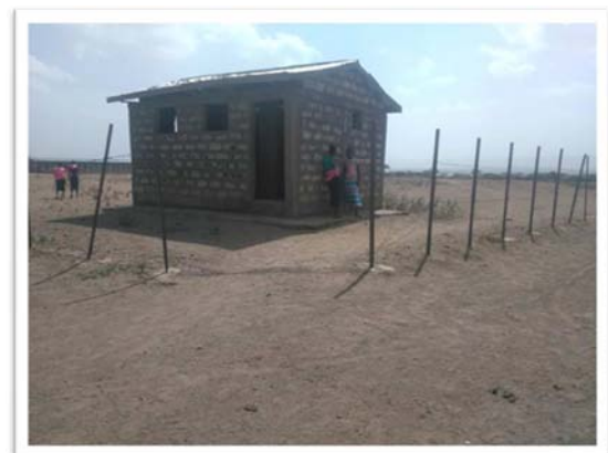
Figure 4. Girls toilet open for passengers due to the broken of school fences in Doni Elementary school, Boset district, East shoa, Oromia Ethiopia, 2016.