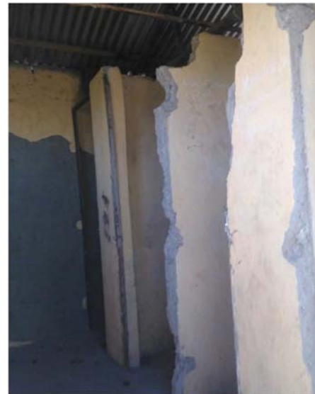
Figure 3. Latrine did not maintain privacy, all the doors to sitting rooms were broken and inside of the sitting rooms were full of feces.